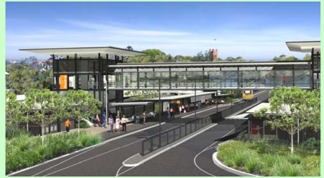
Kedron Brook Busway Station